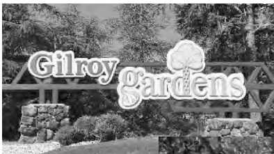
Entrance to Gilroy Gardens