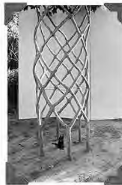
Basket Tree - age 7 years