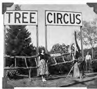
Entrance to Tree Circus Scotts Valley, CA