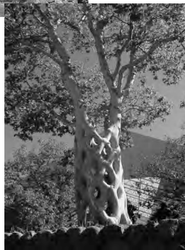
Basket Tree today